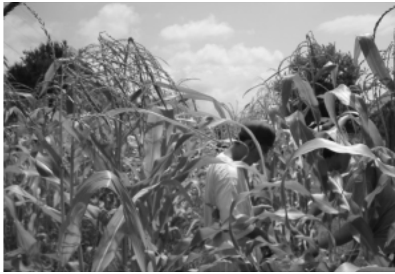
Above: Teens pick corn for their supper. Right: Teens raise the fort's flag.

We are in need of more hike leaders, especially