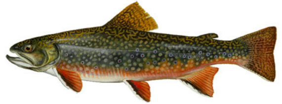
Brook Trout Illustration by Duane Raver/USFWS

The Upper Bald River Wilderness Study Area is the only stand-alone area recommended by the U.S. Forest Service for wilderness designation. The 9,112 acre area was identified as a Wilderness Study Area in the 2004 Forest Plan, and is currently managed consistent with wilderness guidelines. The Wilderness Study Area, along with the existing Bald River Gorge Wilderness (designated in 1984) constitutes most of the Bald River watershed. The area proposed for wilderness designation offers the rare opportunity to protect an entire watershed, thus securing the water quality, trout and wildlife habitat in a well-defined and geographically distinct area. In the process of defining the wilderness boundaries for bill introduction, the total acreage of the Upper Bald River was reduced to 9,038 acres. When the Upper Bald River Wilderness is designated by Congress, this will be the first new wilderness area designated in Tennessee in almost 25 years.